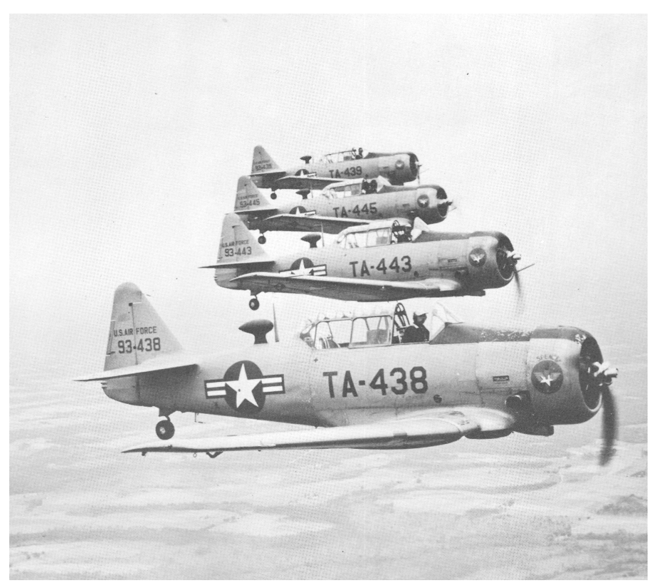
3302 Training Squadron (Contract Flying) T-6Gs in formation.