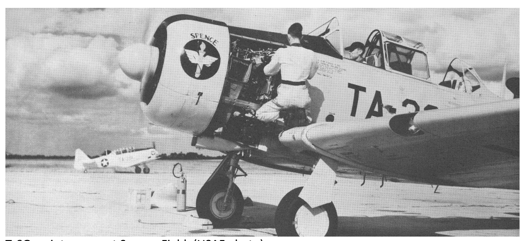
T-6G maintenance at Spence Field.

USAF Unit Histories Created: 20 Sep 2021