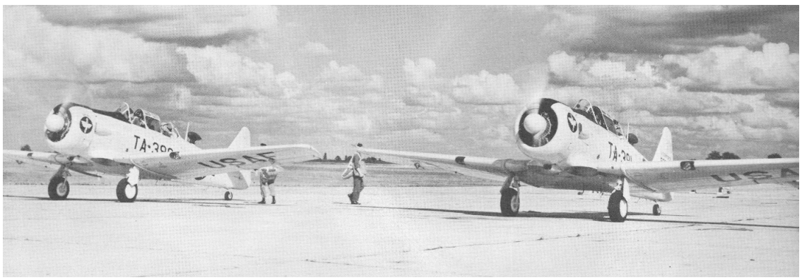
3302 Training Squadron (Contract Flying) T-6Gs at Spence Field.