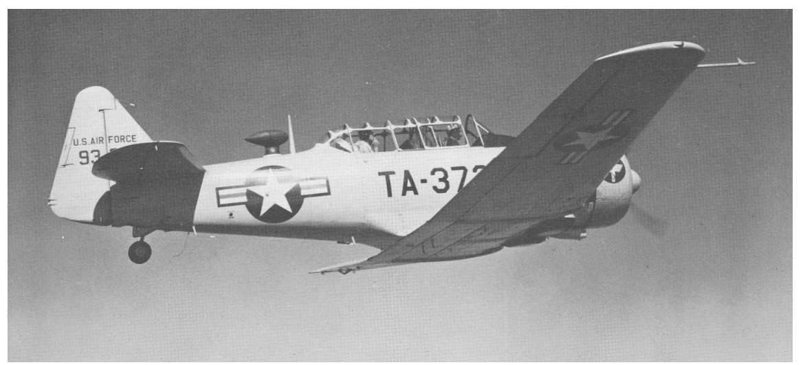
3302 Training Squadron (Contract Flying) T-6G in flight over Spence Field.