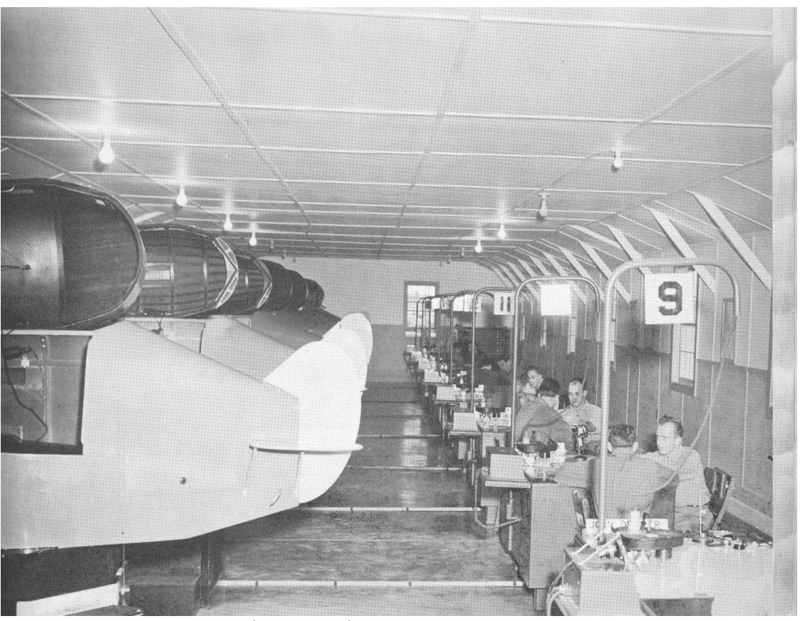
Link trainer at Spence Field, GA.