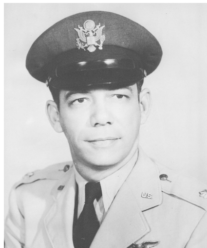
Lt Col Mortimer A. Yates, #1952